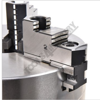
Jaw Rear View