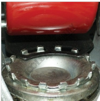
Foot Brake With Swivel Base Lock