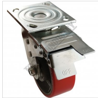
Foot Brake Released