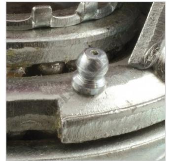
Ball Bearings Base with Greasing Nipple