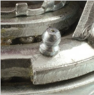
Ball Bearings Base with Greasing Nipple