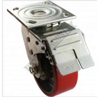
Foot Brake Activated