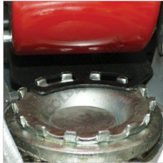
Foot Brake With Swivel Base Lock