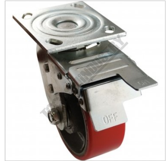
Foot Brake Released