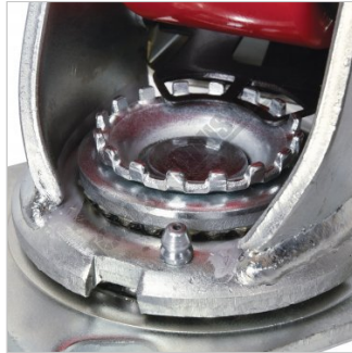
Ball Bearing Base With Greasing Nipple