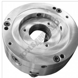
Back of Chuck