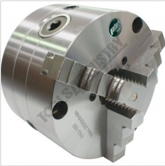
Chuck with Mounting Plate