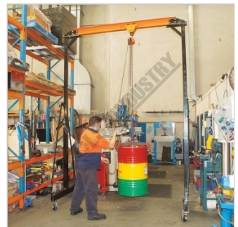
Shown Lifting Oil Drum 2