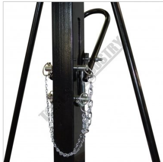
Support Pin Safety Chain with Lynch Pin Clips