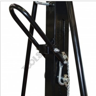
Safety Height Locking Pins