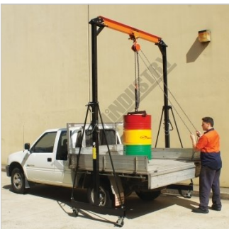
Shown Loading Oil Drum onto Ute