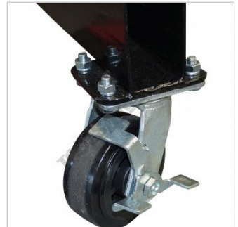
Swivel Wheels with Lock