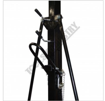
Lever Action Beam Height Adjustment