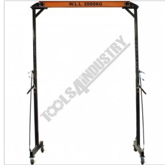
Shown at Full Height