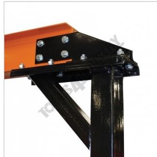
Heavy Duty Beam Support