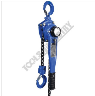
Main View Handle Down