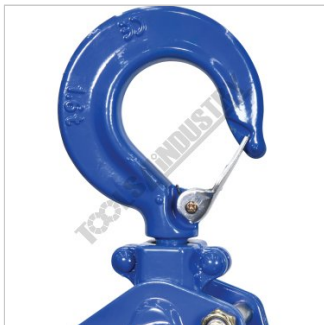
Top Hook Assembly