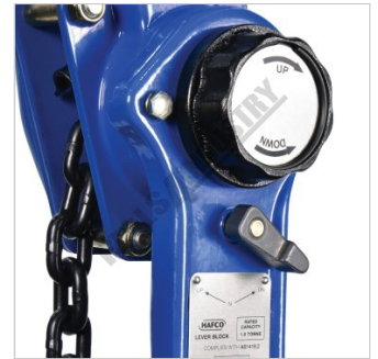
Lever Handle Mechanism