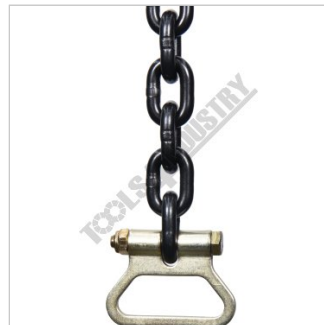
Length Chain End