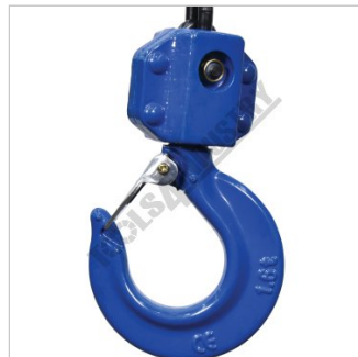
Bottom Hook Assembly