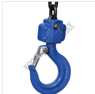
Bottom Hook Assembly