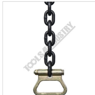
Length Chain End