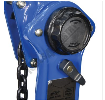
Lever Handle Mechanism