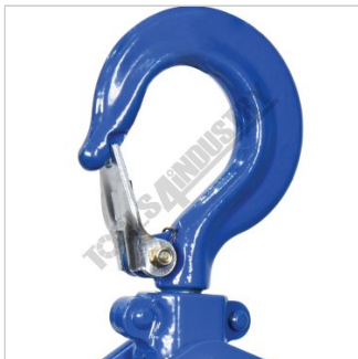
Top Hook Assembly