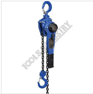
Main View Handle Down