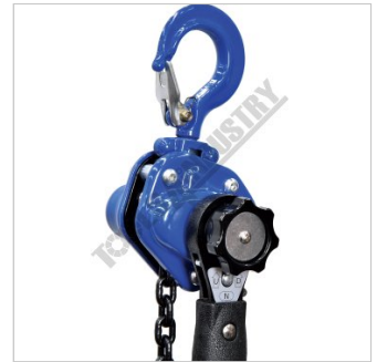
Lever Handle Mechanism