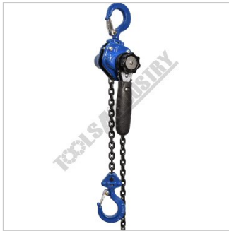
Main View Handle Down