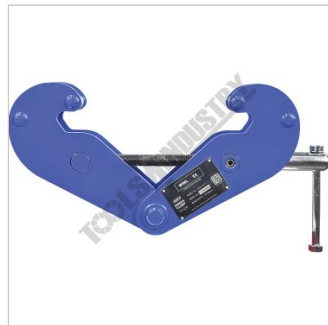
Front View 3