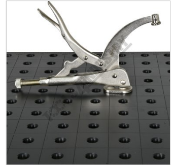
Shown on Welding Table Jaw Open