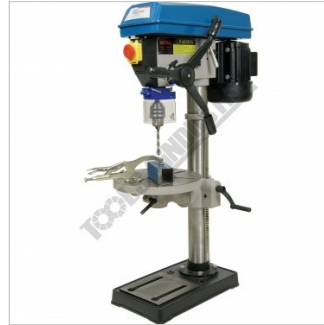
Shown Clamping Job on an Optional Drilling Machine