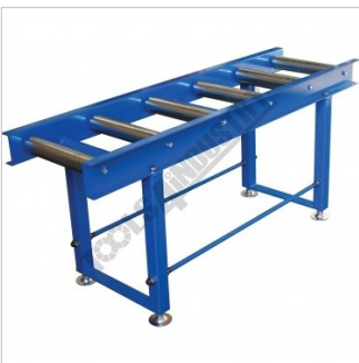
1.5 Metre Conveyor