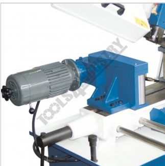
Motorised Material Feed