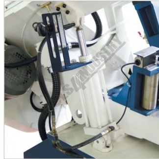
Ram Height Adjustment