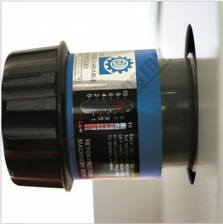
Variable Speed Adjustment