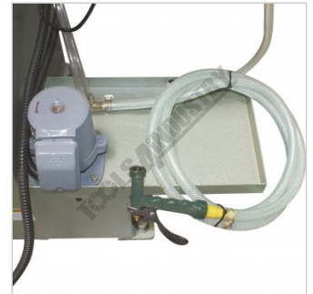
Coolant and Hose