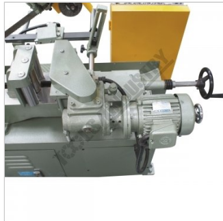
Feed Rolls Drive System