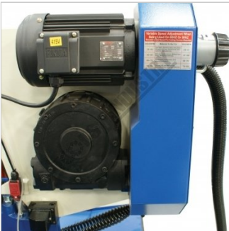
Heavy Duty Gearbox