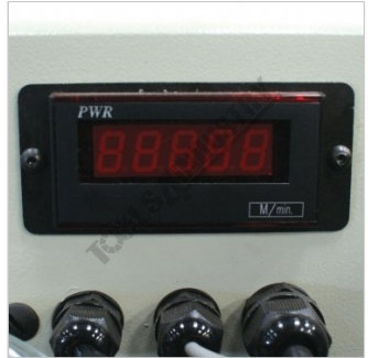
Digital Blade Speed Display