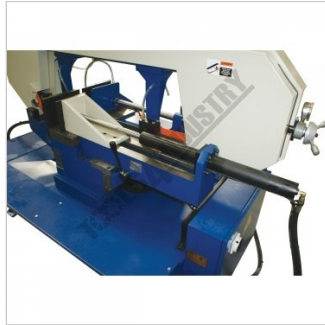
Full Stroke Hydraulic Clamping Vice