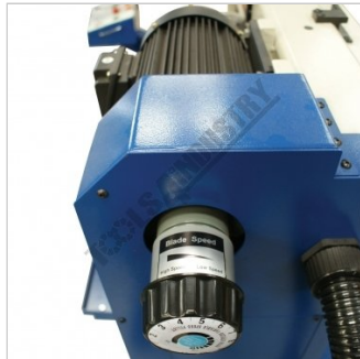
Variable Blade Speed