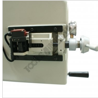
Automatic Blade Breakage Sensor