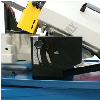
Height Adjustment for Arm Return