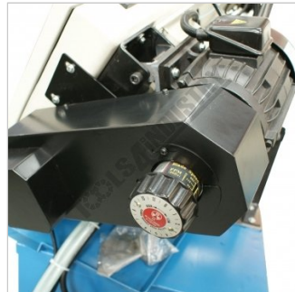
Variable blade speed