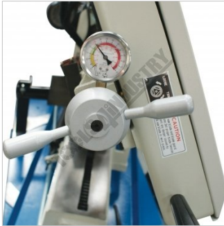
Blade Tension Levers With Gauge