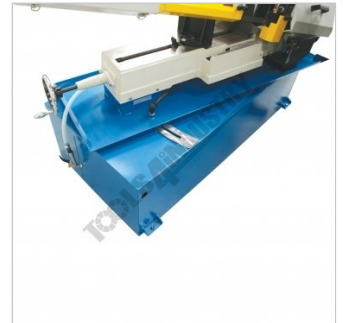
Swivel Head For Mitre Cutting