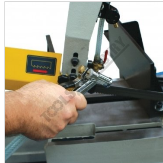
Coolant Cleaning Gun