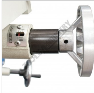
Blade Tension Gauge