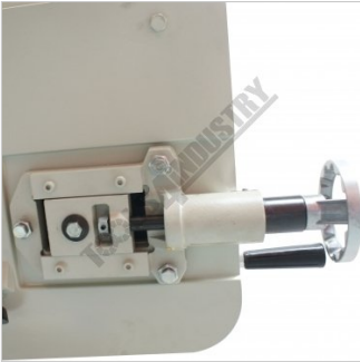
Blade Tension System