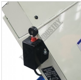
Left Blade Guard Safety Micro