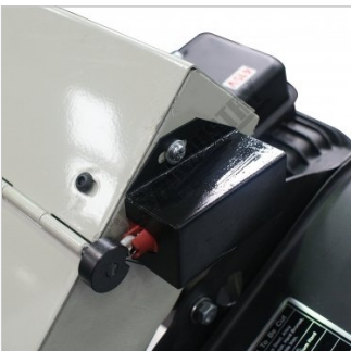
Blade Guard Safety Micro Switch