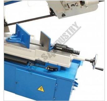
Quick Action Material Clamping System