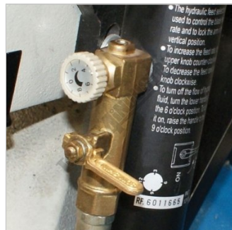
Down Feed Control