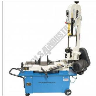
Head Fully Raised