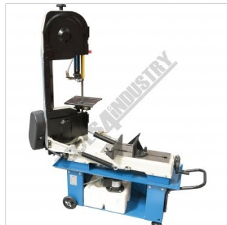
Shown Set Up with Vertical Cutting Table Rear View