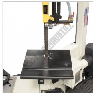
Vertical Cutting Table