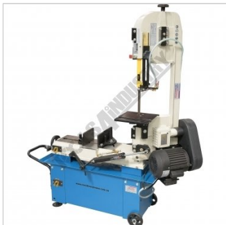
Shown Set Up with Vertical Cutting Table