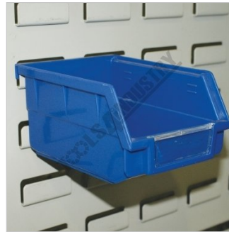
Shown with Optional Buckets