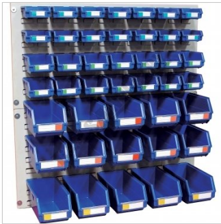
Shown with Optional Buckets on Panels