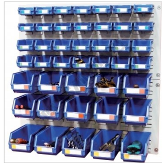
Shown with Optional Buckets and Tools