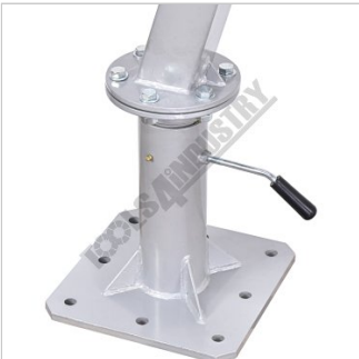
Swivel Base Greaseable with Locking Handle