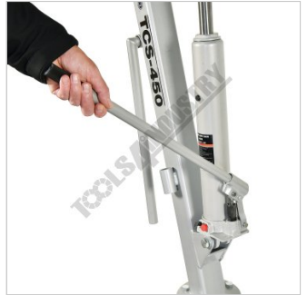
Single Action Hydraulic Pump