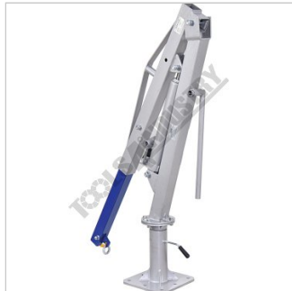
Rear View Fully Down