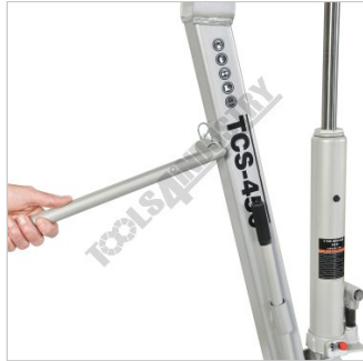
Handle for Swivelling Crane