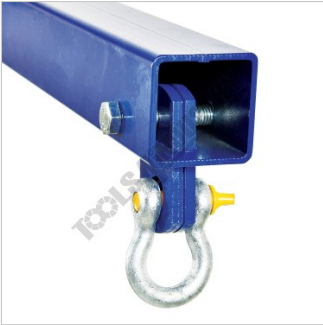
Supplied with Load Rated Bow Shackle