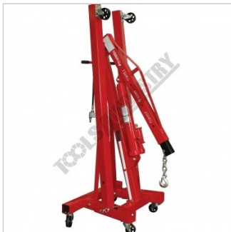
Shown Folded Up