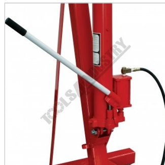
Single Action Manual Pump