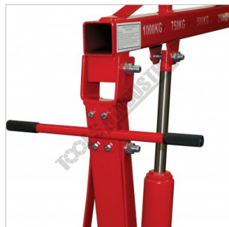
Handle For Easy Manoeuvrability