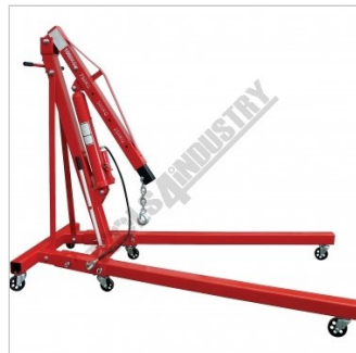
Shown With Ram Fully Down