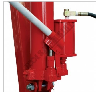
Single Action Pump With Release Valve