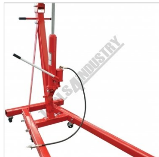
Pneumatic Hydraulic Single Action Ram