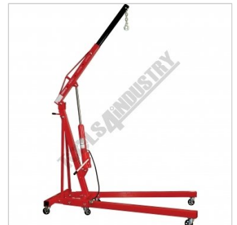
Shown Fully Up and Extended