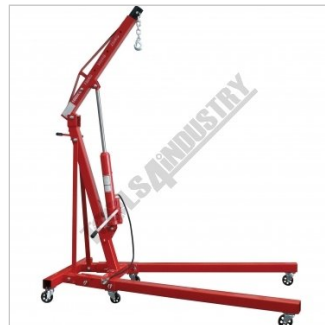
Shown Fully Up