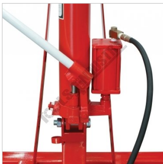
Pneumatic Hydraulic Pump