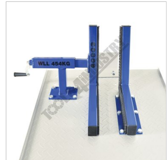
Front Wheel Clamp Adjustment