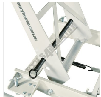
Two Position Safety Locking Bar