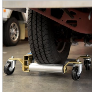
Shown Lifting Small Truck Wheel Front View