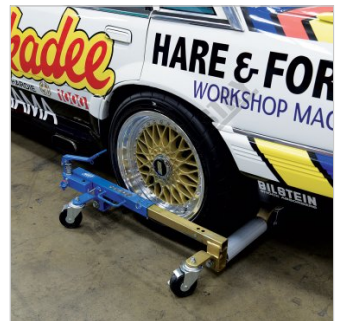
Positioning Jack in Place 2