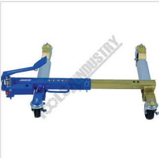
Front View Extended