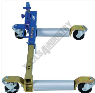
Side View Extended