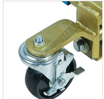
2 x Swivel Brake Wheels