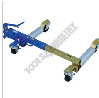
Right Side Extended