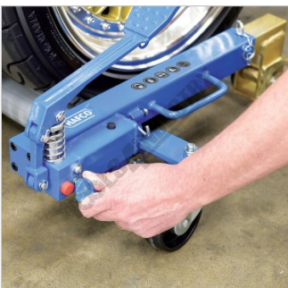
Closing Release Valve Ready for Pumping Jack