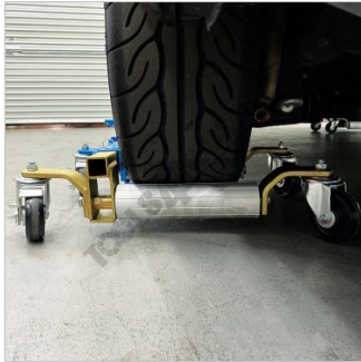
Under Car Rear View