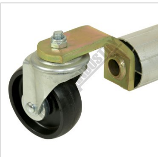
2 x Swivel Wheels