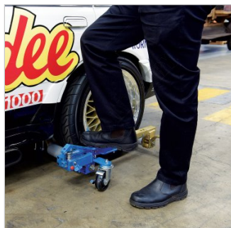
Hydraulic Foot Pump