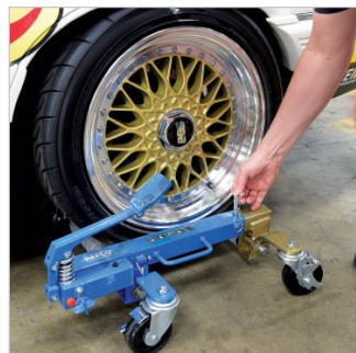
Inserting Safety Lock Pin