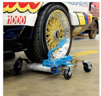
Wheel Jacked Ready to Move Vehicle