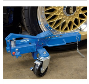
Foot Pedal Position Lock