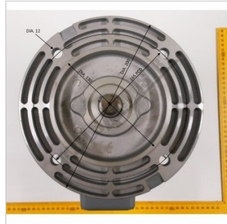
5BM0116 MOTOR 415V 7A 1