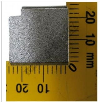
4BM0103 BLADE GUIDE UNIT no.103.1