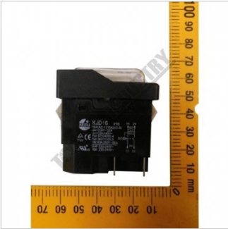
2TB0128 side view