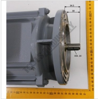
2BM0036 MOTOR 415V 3.6A 1.1KW 1