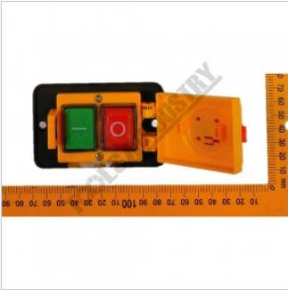
2BC0226 Switch 250V Lid Open