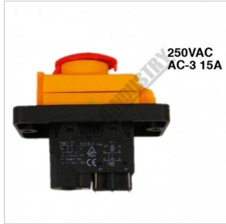
2BC0226 Switch 250V Side View